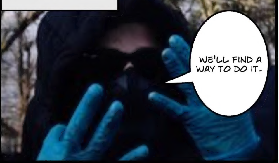
MEANWHILE AT DARKODE'S HQ---

I WAS THINKING ABOUT THE DOING THE SAME.